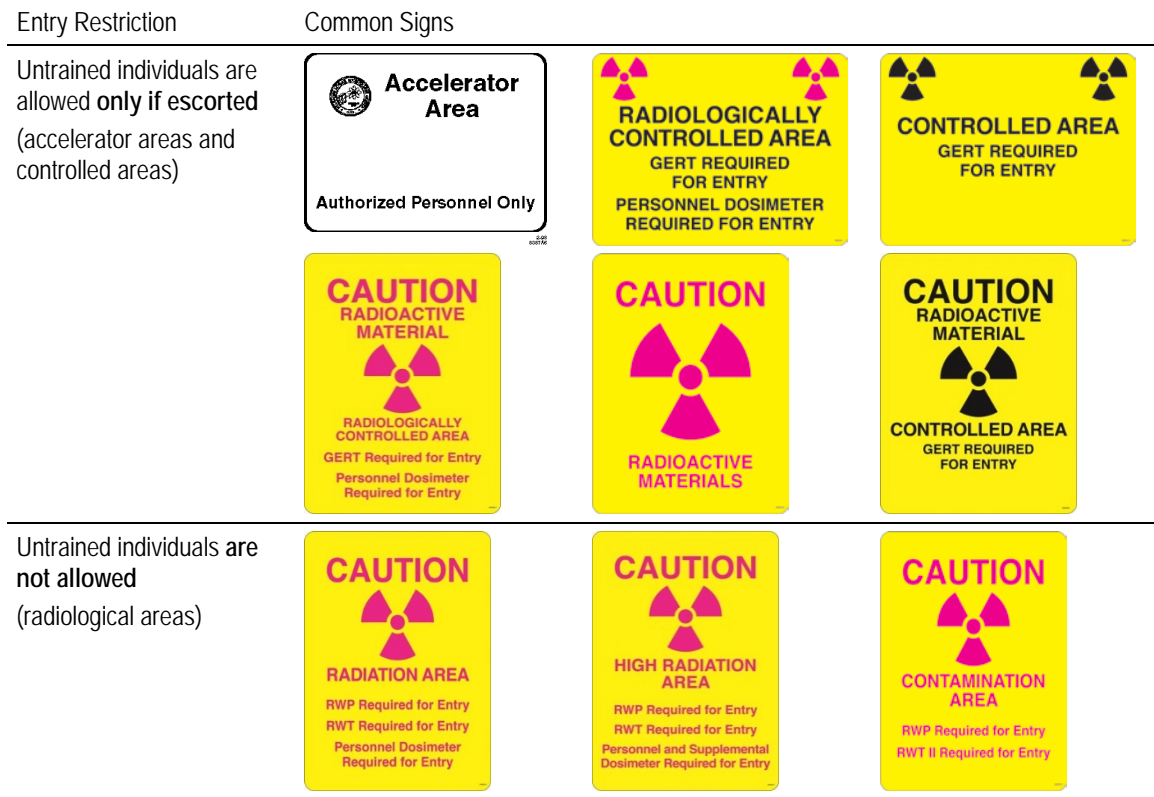
Table 1 Common Area Classification Signs to Be Observed at SLAC

The embryo-fetus is known to be more sensitive to radiation than adults due to the rapid division rate of developing cells. Radiation doses can increase the chances that the child will experience slower growth or mental development, or develop childhood cancer. Women who are or may be pregnant, or who are planning a pregnancy, should consult with the Radiation Protection Department before the visit.