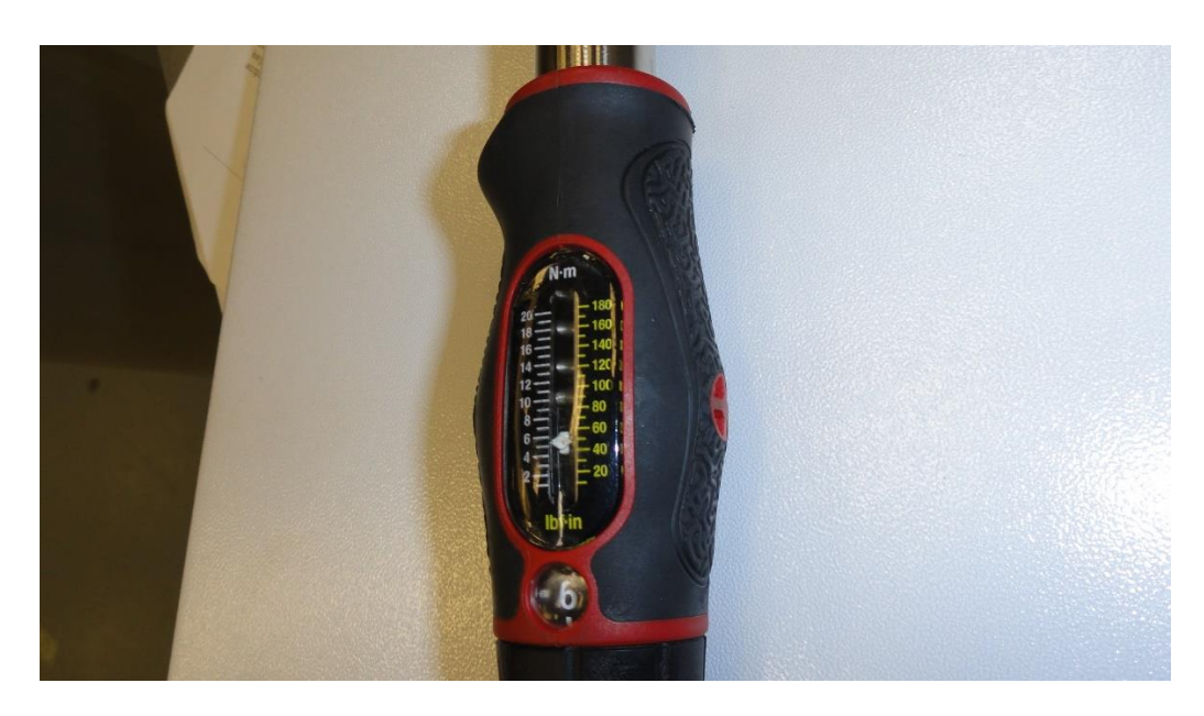
Torque setting for M6 screws (5.6 N-m)