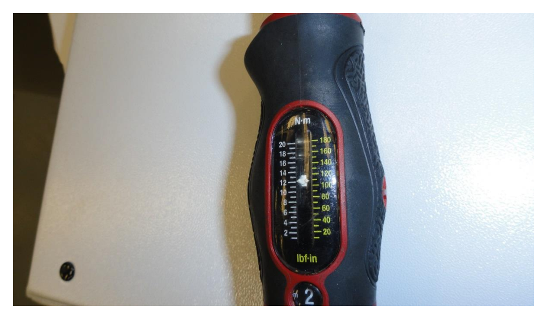
Torque setting for M8 screws (12.2 N-m)