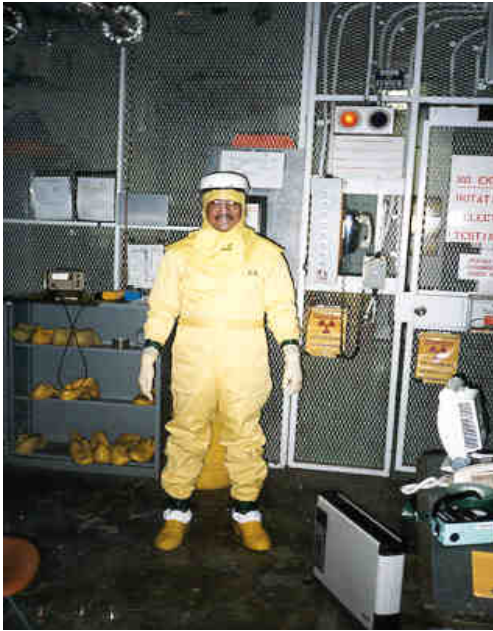
Figure 2-13 A Full Set of Protective Clothing

For an example of full protective clothing, see Figure 2-13.