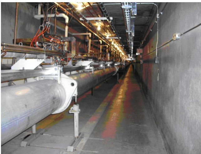
Figure 2-5 Good Housekeeping in the Linac Housing