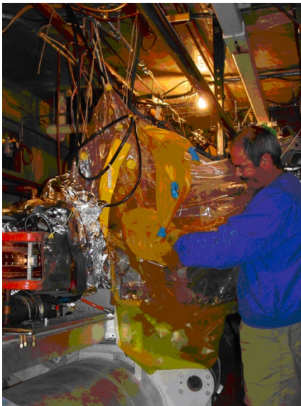
Figure 2-11 Worker Using Glovebag

Containment generally refers to vessels, pipes, cells, glovebags, gloveboxes, tents, and/or plastic coverings that contain and control radiological contamination. Bags are used extensively to contain and hold contaminated materials. Figure 2-11 shows a worker using a glovebag.