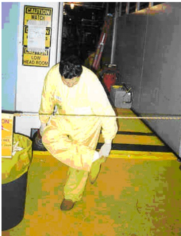
Figure 2-14 Doffing Protective Clothing at Contamination Area Boundary

Proceed to the frisking instrument and follow frisking procedure.