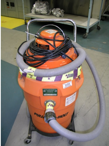
Figure 2-10 Radiological Vacuum