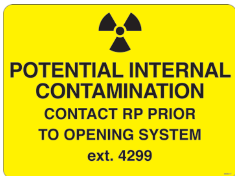
Figure 2-3 Label Warning of Potential Contamination in an LCW System or Component

Note Tritium is difficult to detect with typical field portable instruments because of its low beta radiation.