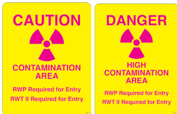
Figure 2-7 Signs That Indicate a Contamination Area and a High Contamination Area

The boundary of a contamination area is identified with signage such as shown in Figure 2-7. The signs may be mounted on yellow and magenta ropes or at the doors and the gates.