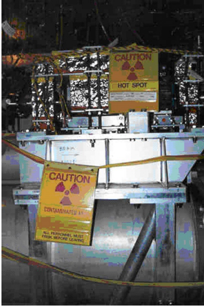
Figure 2-1 Signs That Indicate a Hot Spot and Radioactive Contamination

The following sections discuss the location and requirements pertaining to actual and potential contamination sources such as LCW systems, which may contain tritium, and beam line components, which may release contamination when they are disassembled. Other potential sources of radioactive contamination include airborne contamination, radiological containers, poor work practices, machine operations, and poor housekeeping.