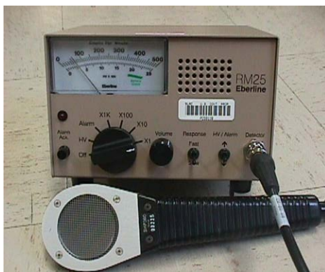
Figure 2-9 Eberline RM 25 Frisker