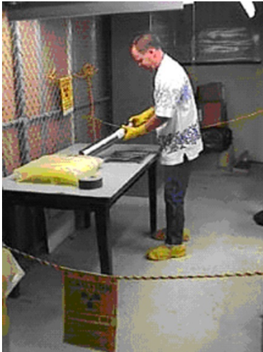
Figure 2-12 Minimum Protective Clothing