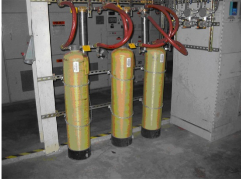
Figure 2-2 LCW Resin Bottles Connected to Cooling Systems

These systems are labeled, and may include, but are not limited to