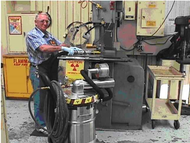
Figure 2-4 A HEPA-filtered Radiological Vacuum Removes Machined Radioactive Material